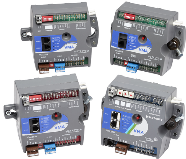
Figure 1: VAV Modular Assembly Controllers (VMAs) Family

If the product fails to operate within its specifications, replace the product. For a replacement product, contact the nearest Johnson Controls® representative.